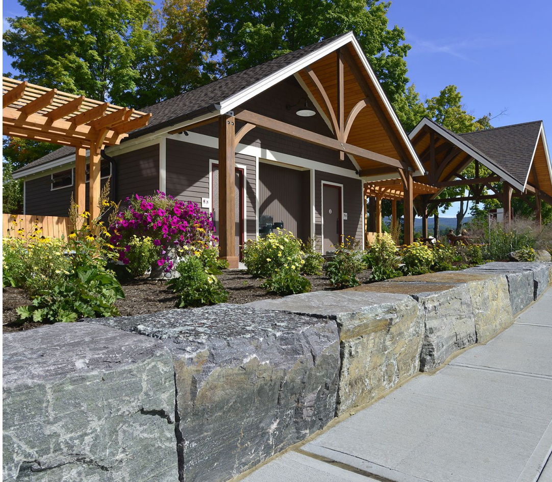
Cut Stone Blocks – Split Faced