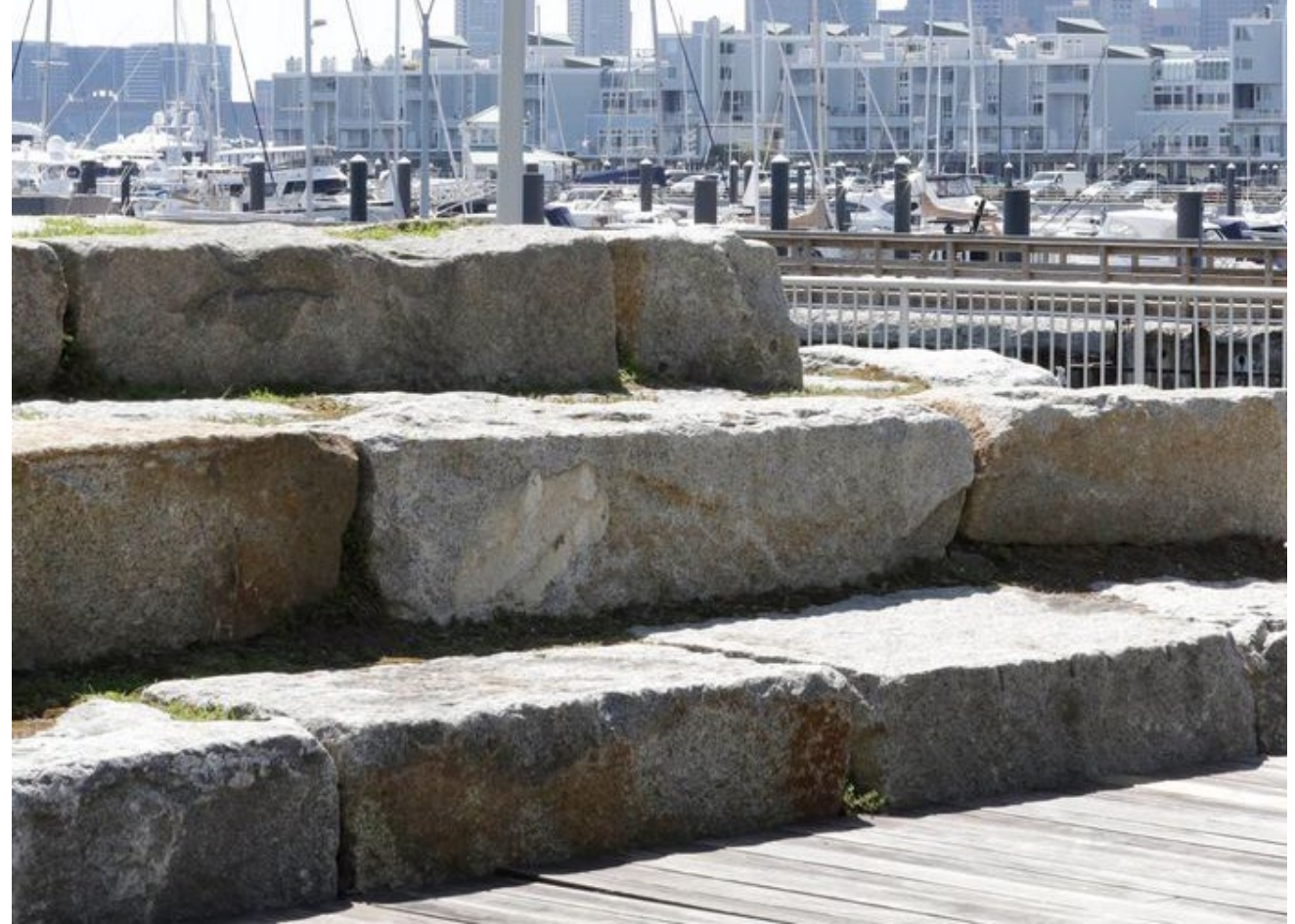
Reclaimed Stone Blocks