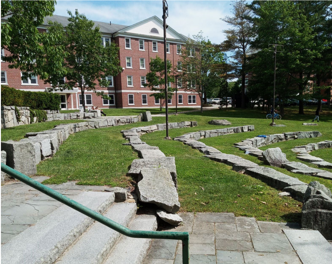
Bates College Amphitheater