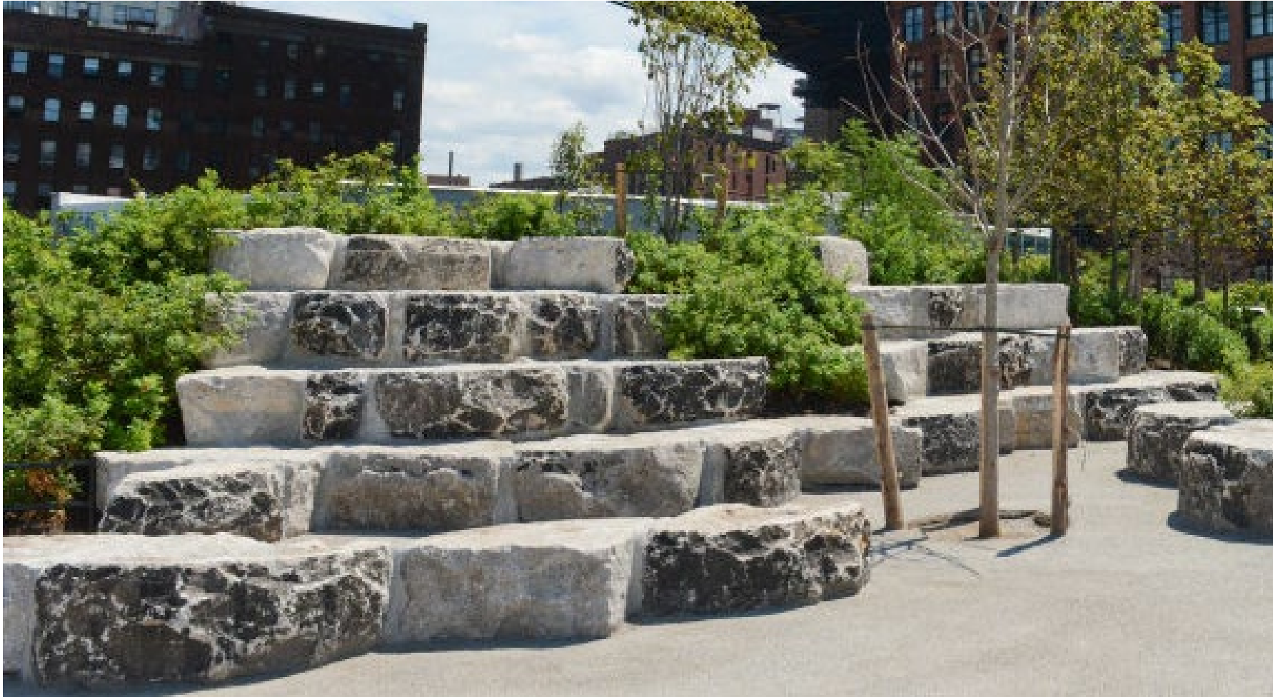
Cut Stone Blocks – Rocked Faced